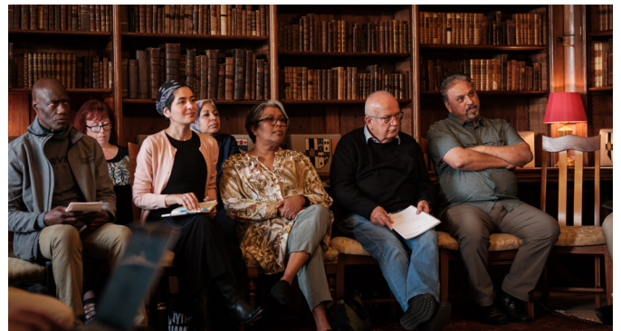
Tanenbaum Peacemakers in Action Network at the Working Retreat