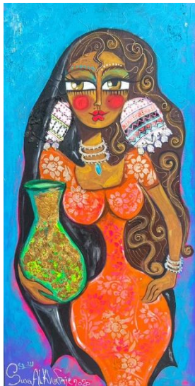
Iraqi Woman by Sura Al Khafaji

Two special pieces will be auctioned live during the evening, thanks to Christie’s Auction House. The remaining 40 works will be offered for purchase through an online silent auction powered by Artsy. Tickets for the exclusive auction reception at the Rubin Museum are available for purchase on Tanenbaum’s website .