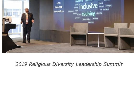
2019 Religious Diversity Leadership Summit