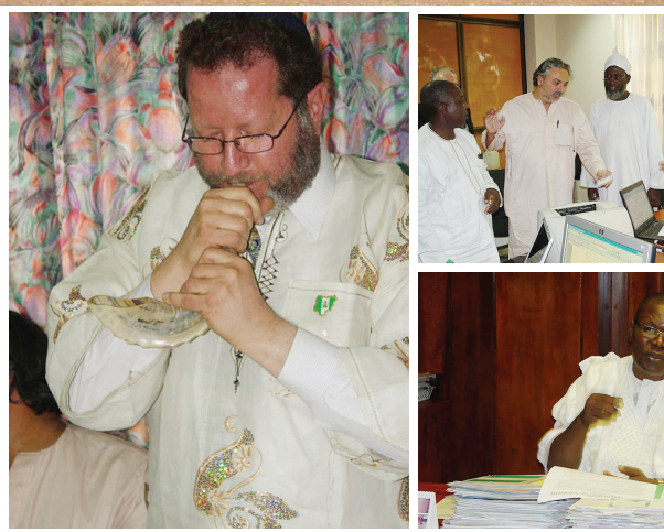
Clockwise from Top: The Peacemakers addressed the Young Ambassadors, a group of interfaith youth promoting understanding and acceptance through sports; Meeting with the leadership of Nigerian Supreme Council for Islamic Affairs; A gover nment official receives the Sta with the shofa