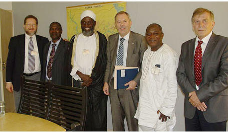
Above: The Delegation met with top-ranking diplomats from around the world.