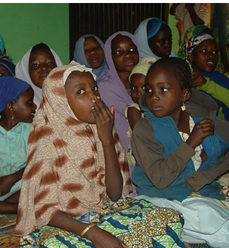
Above: A group of children at the local mosque.