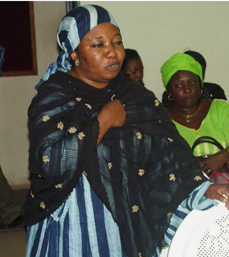
Above, left & right: Participants in the seminar at the University of Jos listened to Peacemaker presentations and asked questions.