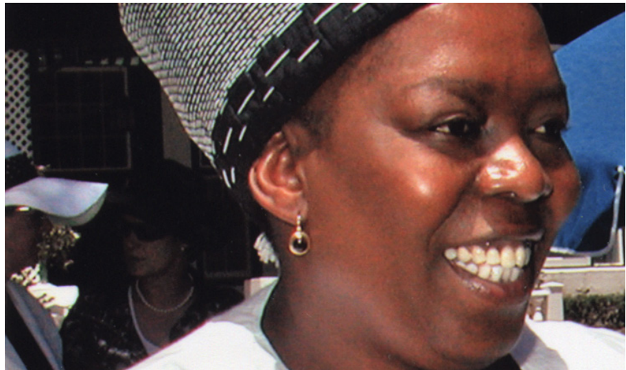
Peacemaker Nozizwe Madlala-Routledge of South Africa

The next day, Nozizwe listened to the activists tell their stories. There was a visit to a cultural site and then cause for more celebration, as an Alawite woman and a Sunni man wed, a joyous occasion demonstrating love and interfaith harmony in a land strained by sectarian differences.