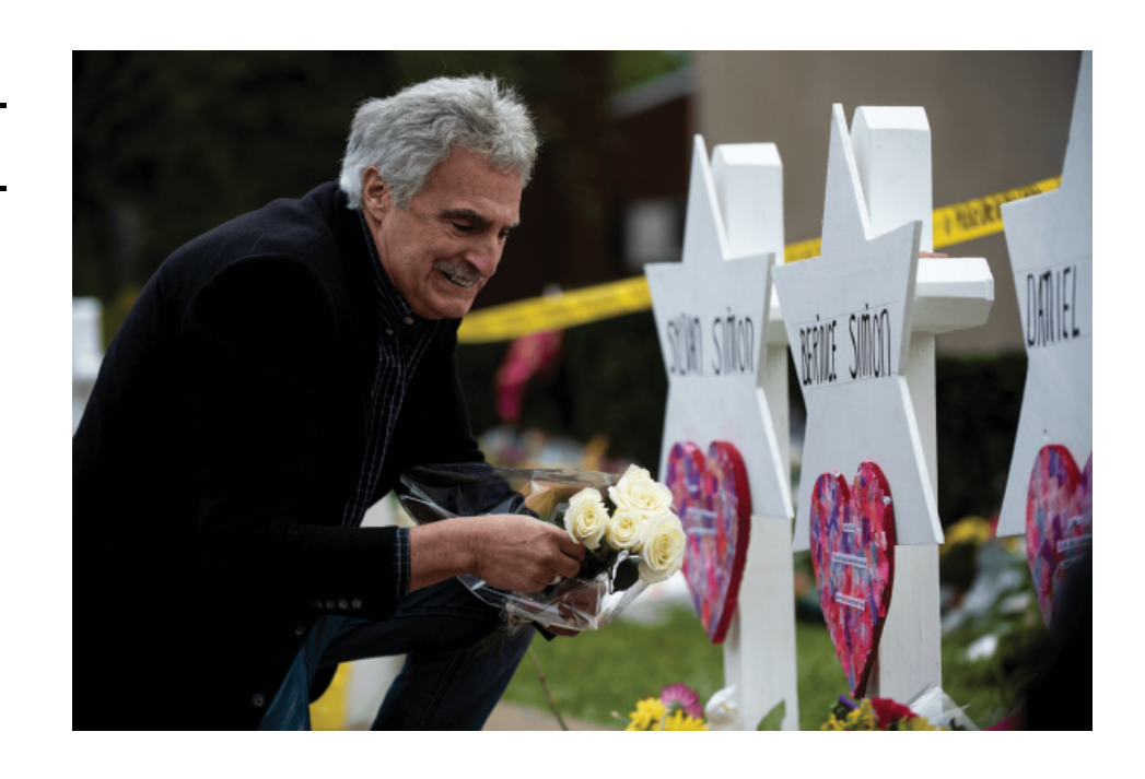
Mourner after the killings at Tree of Life Synagogue in Pittsburgh

AMID THE NOISE of our news cycles, there are the occasional stories that become part of our personal journeys. Sometimes, we only need a word or phrase to bring them back with full force, like "the Holocaust" or "9/11." Sometimes, it's just the name of a city. Pittsburgh. El Paso.